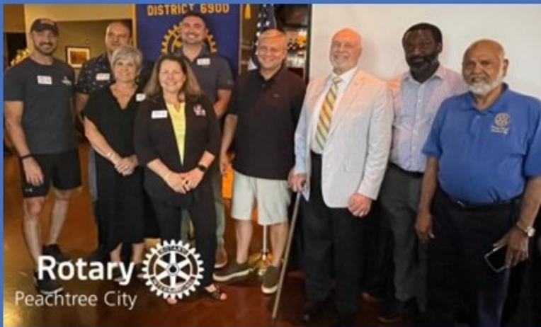
Rotary Peachtree City