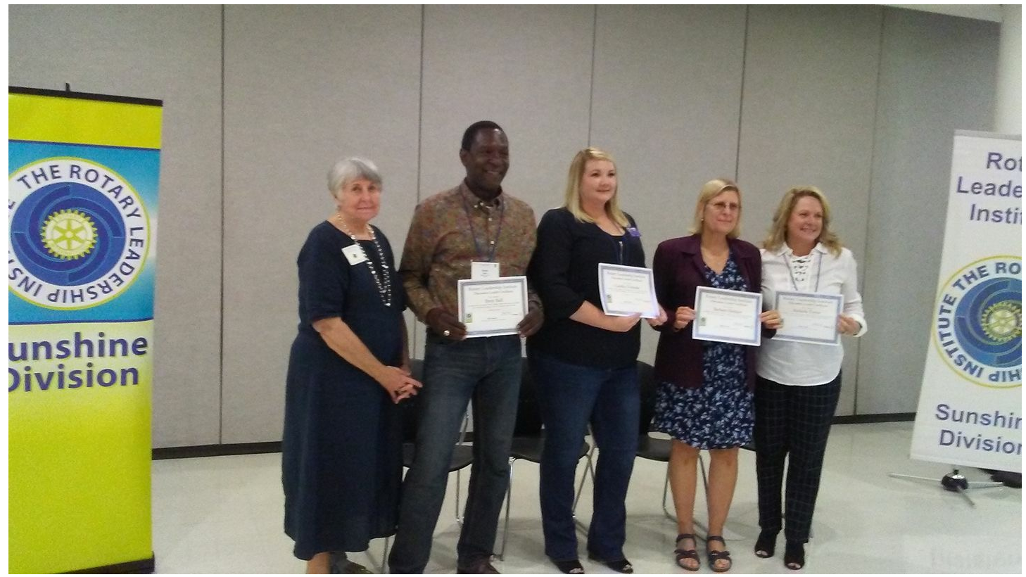
Posted by Elwyn Gaissert, II July 7, 2018