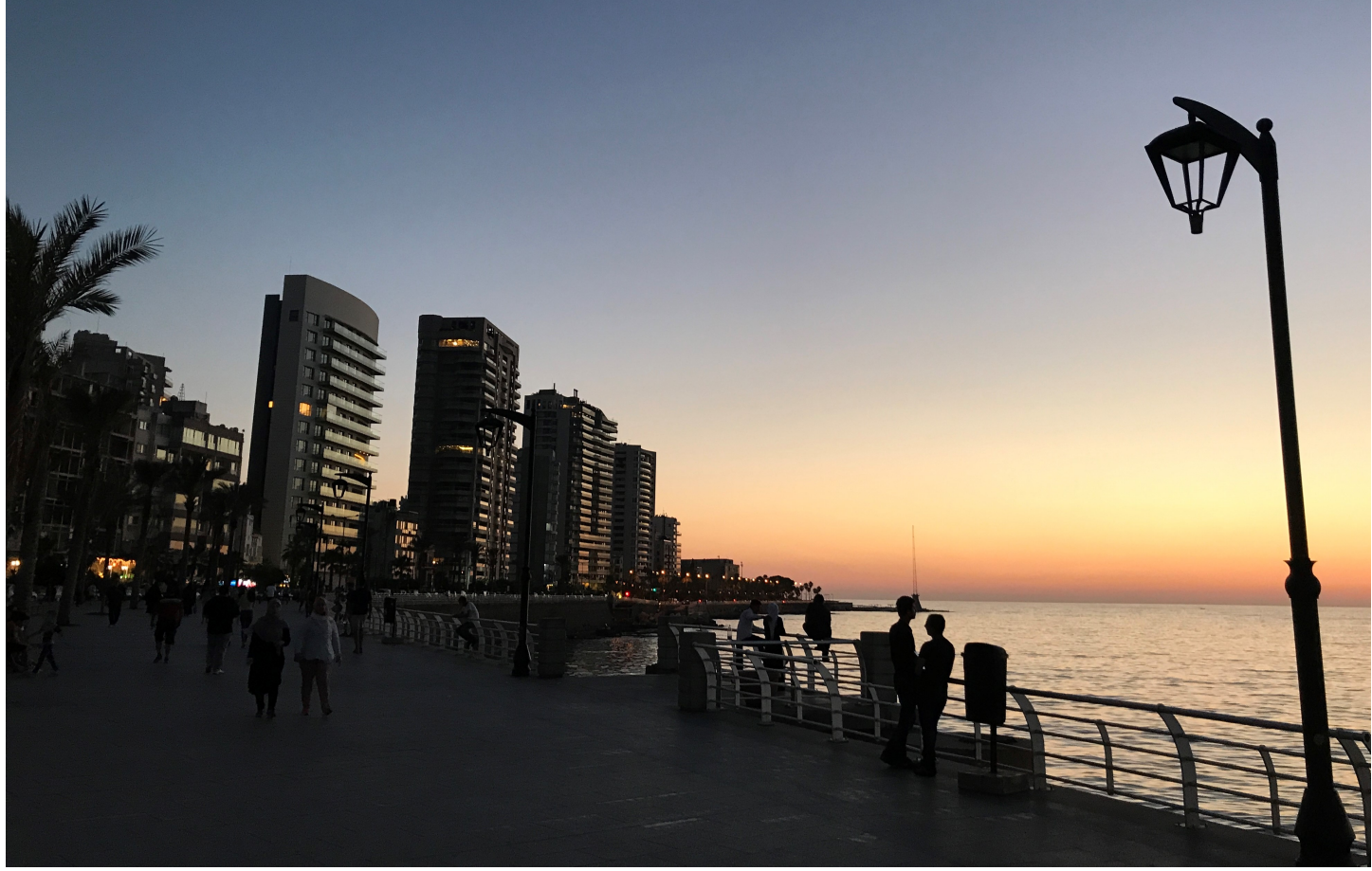
Posted by Jackie Cuthbert July 7, 2018