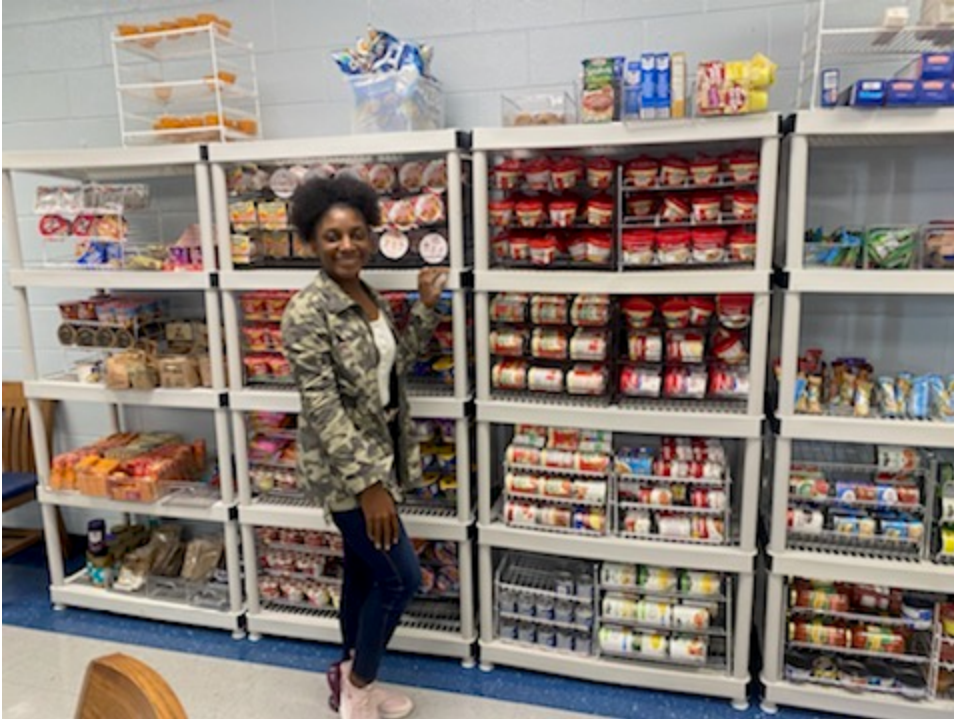
Posted by Laurie Lewis December 3, 2021