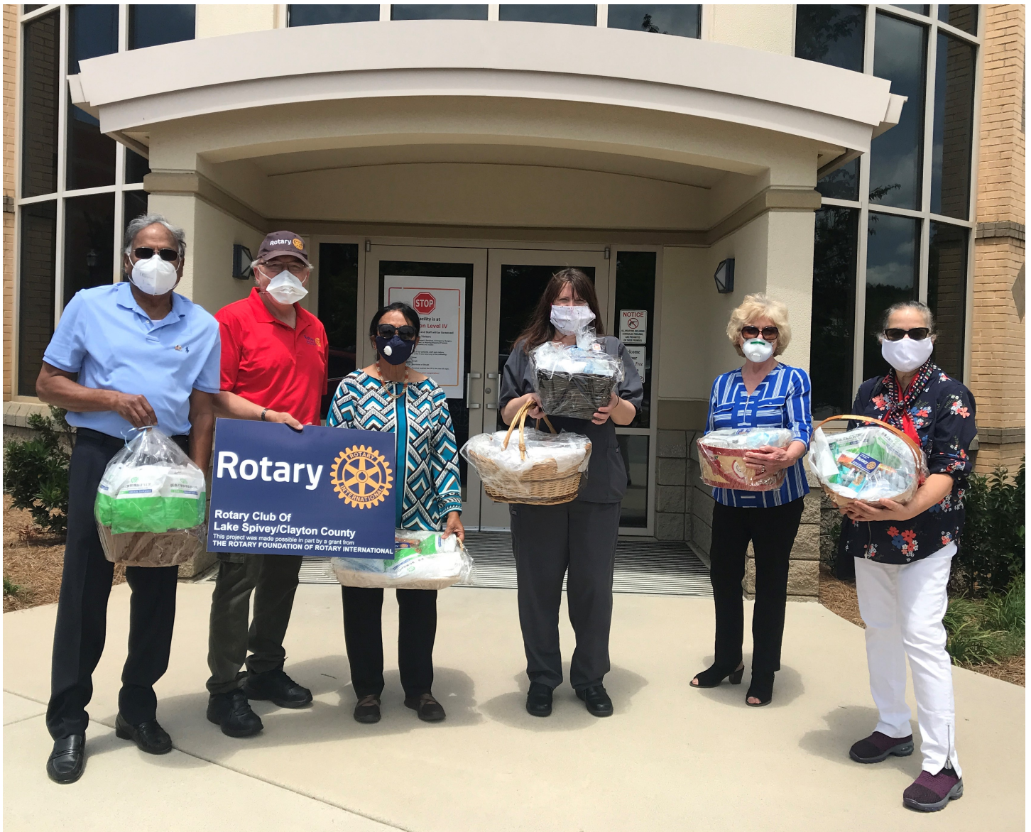
Posted by Ron Swofford May 28, 2020