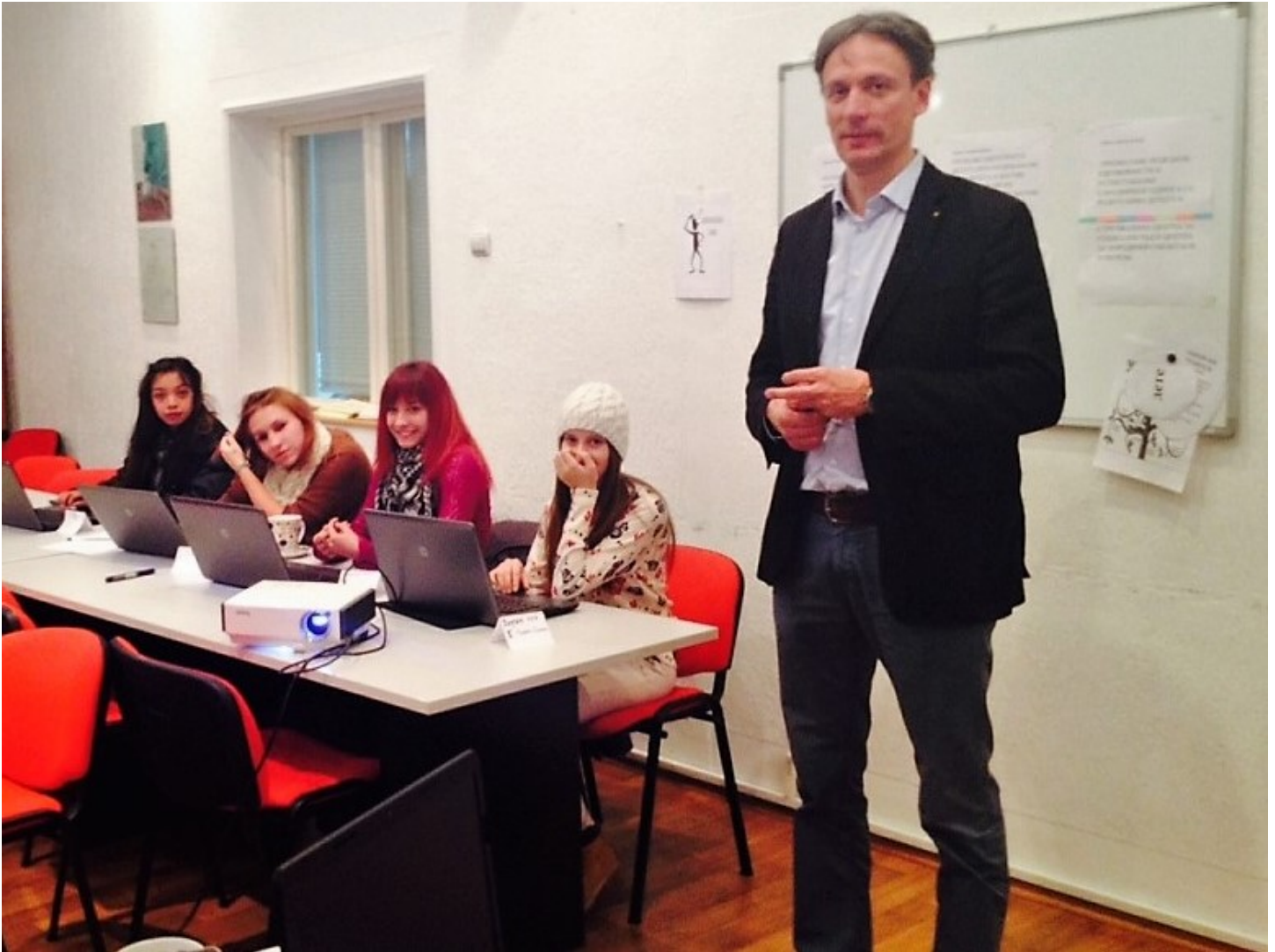
Serbian class working with computers

Thanks to the Thomasville Rotary Club , teenage orphan and foster youth in Serbia are learning computer skills that will give them a better chance at self-supporting lives. The club donated $7,500 to the project, which was matched by a district grant of $7,500 and a Rotary Global Grant that brought the total to $30,000.