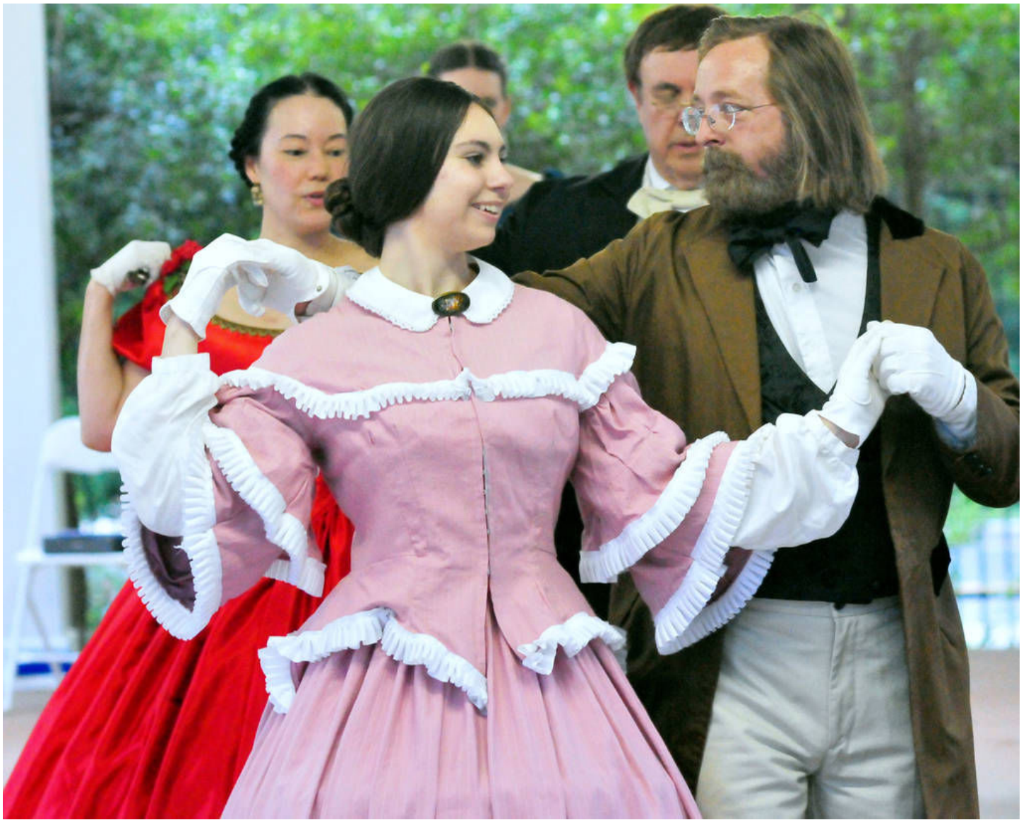
Lake Spivey/Clayton County dancing