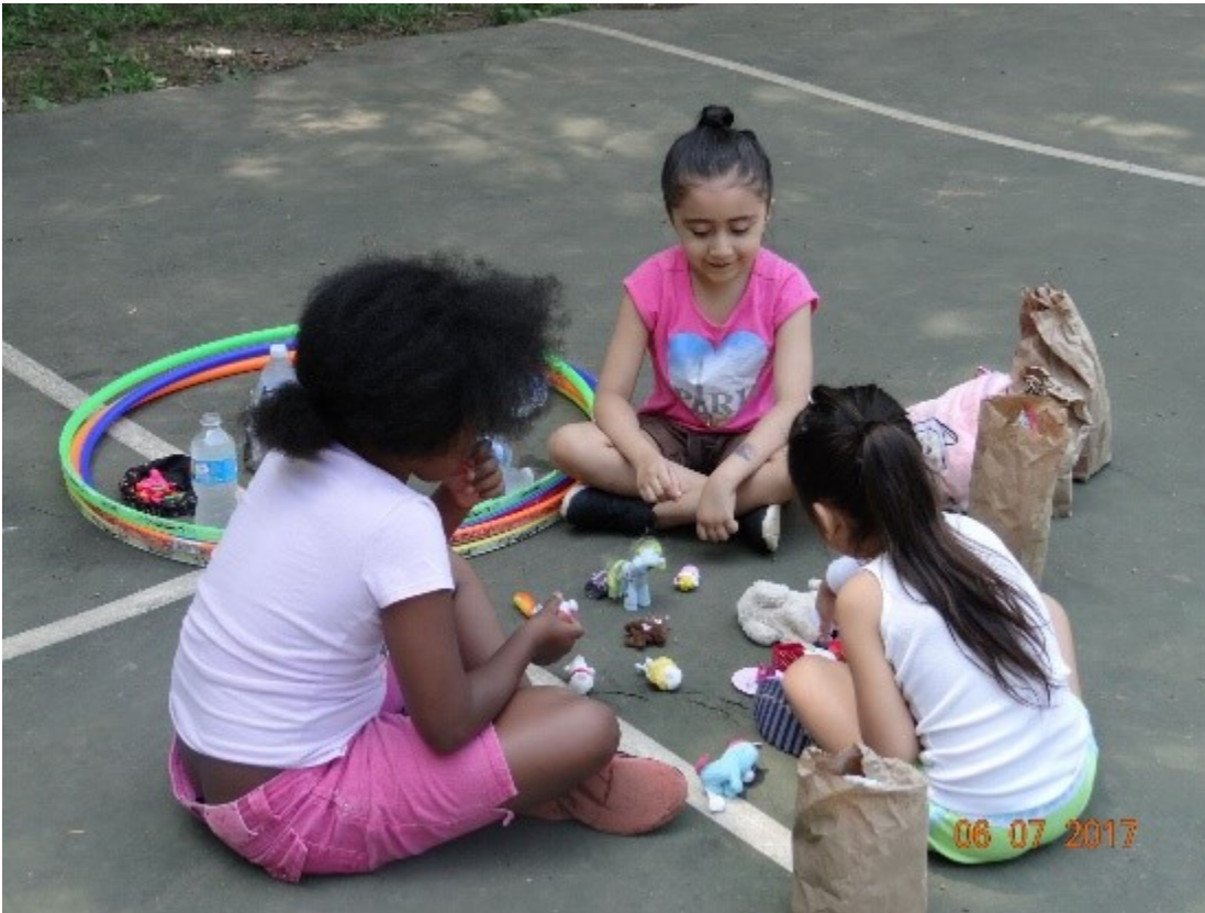
Children benefiting from Alpharetta's summer lunch program