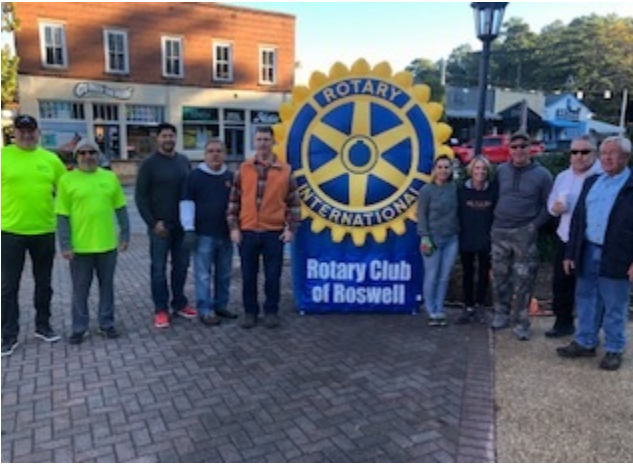
Posted by Trummie Patrick November 1, 2020