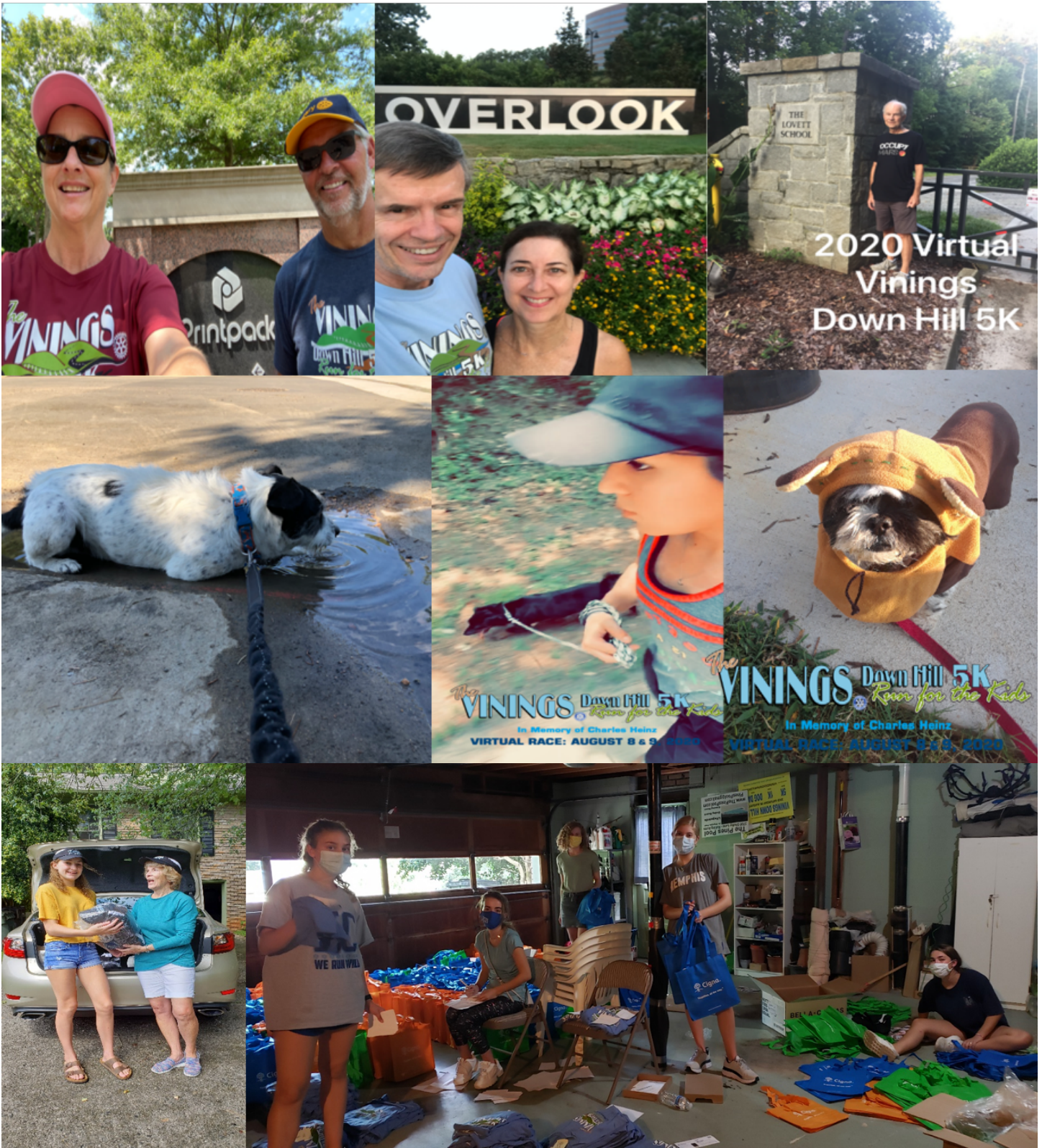
Pope High School Interactors help with tee-shirts and hats for this year's race