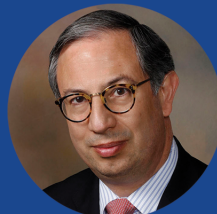
Carlos del Rio