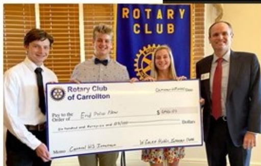
Above: Carrollton Rotary extends Many, many thanks to the Central High School Interact Club for its donation to our End Polio Now campaign!